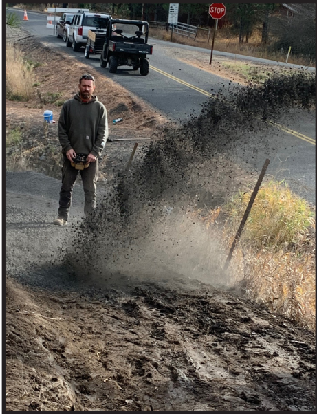
- Remote Control Conveyor -