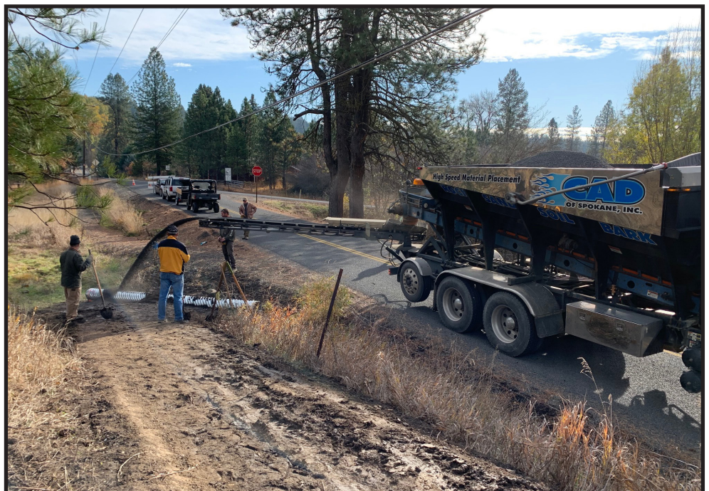
- Cad Truck Distributing Gravel Around Newly Installed Culvert -

- Connector Trail / Continued on page 3 -