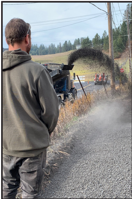
- Gravel Distribution -